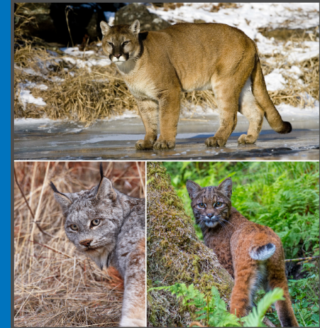
Wild cats of BC: cougar (top), lynx (bottom left), bobcat (bottom right).

Large prey takes a number of days to eat and the cougar will pull debris over the carcass to keep off scavengers. The cougar will stay near a kill site until the prey is totally consumed. If you find a kill site, leave the area immediately.